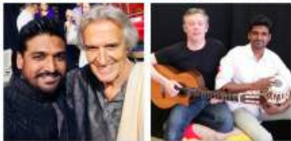
Worked with Indian artists like Jagjit Singh Ji, Salman Khan, Ranveer Singh,