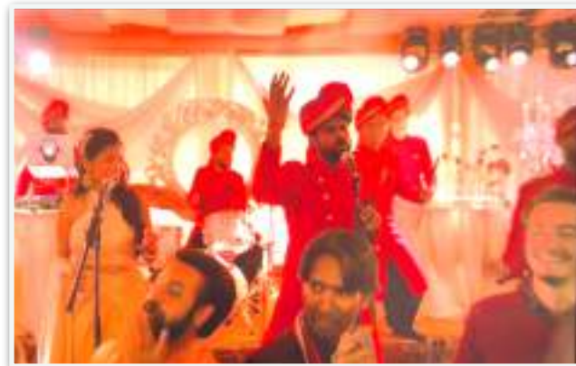
Acted in Netflix blockbuster movie "Murder Mystery 2"