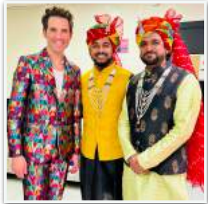
With Singer MIKA at the concert for "Bal de la Rose" organized by Prince of Monaco