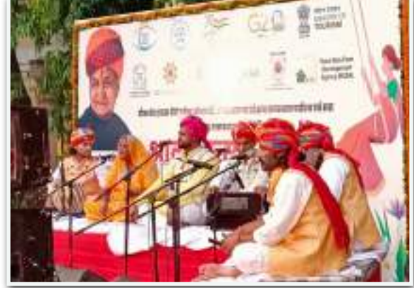
Performing at "Shravani Teej" Utsav at Bikaner house in Delhi organized by Rajasthan Tourism & Rajasthan Foundation