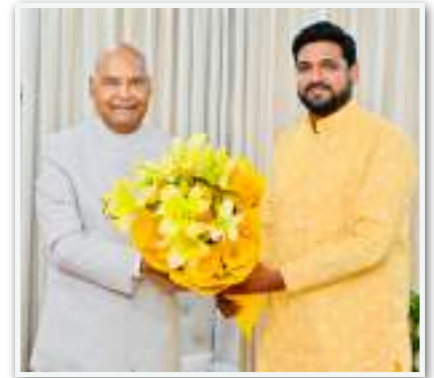
With Hon'ble former President of India Sh. Ram Nath Kovind ji