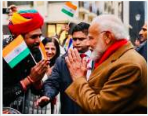
With Hon'ble Prime Minister of India Sh. Narendra Modi ji & Hon'ble President of France Mr. Emanuel Macron