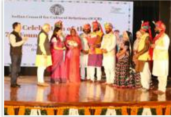
Performed at ICCR auditorium in Delhi