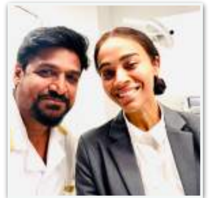
Shooting with Avatar star Zoe Saldana for the upcoming film Emelia Perez