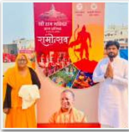
Extremely honored to perform at "Ramotsav" on the occasion of Pran Pratishtha ipad Shri Ram Mandir in Ayodhya