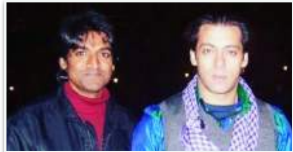
Arjun Kapoor, Dilip Sen-Sameer Sen etc...